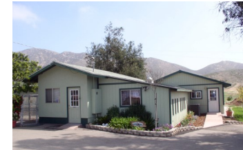
Kennel in the Country

Please allow 30 minutes to complete admission of your pet. New clients must arrive no later than 4:00 pm.